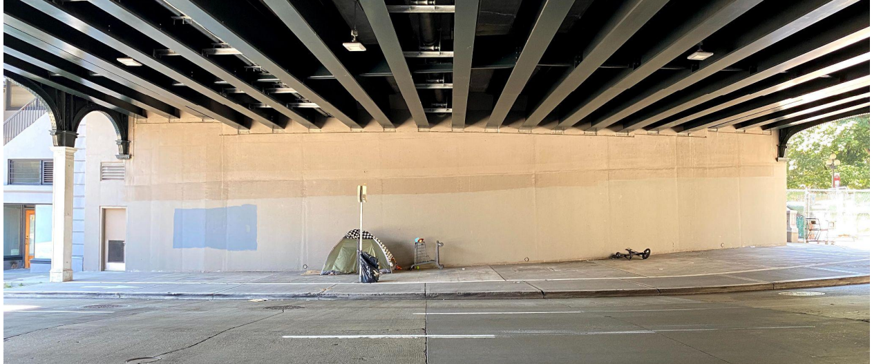
Photo of the project site looking north on 4th Ave (captured Wednesday, August 4, 2021):

Photo of the project site looking west across 4th Ave (captured Wednesday, August 4, 2021):