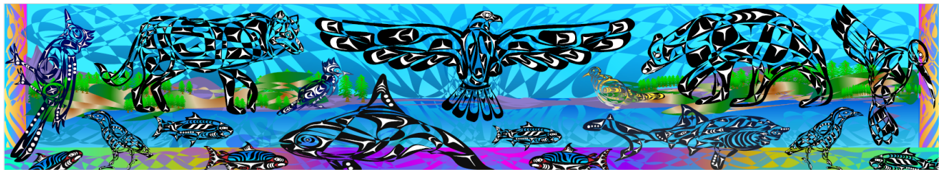
Image of Mural Concept Design

Materials -Paint and an anti-graffiti clear coat.