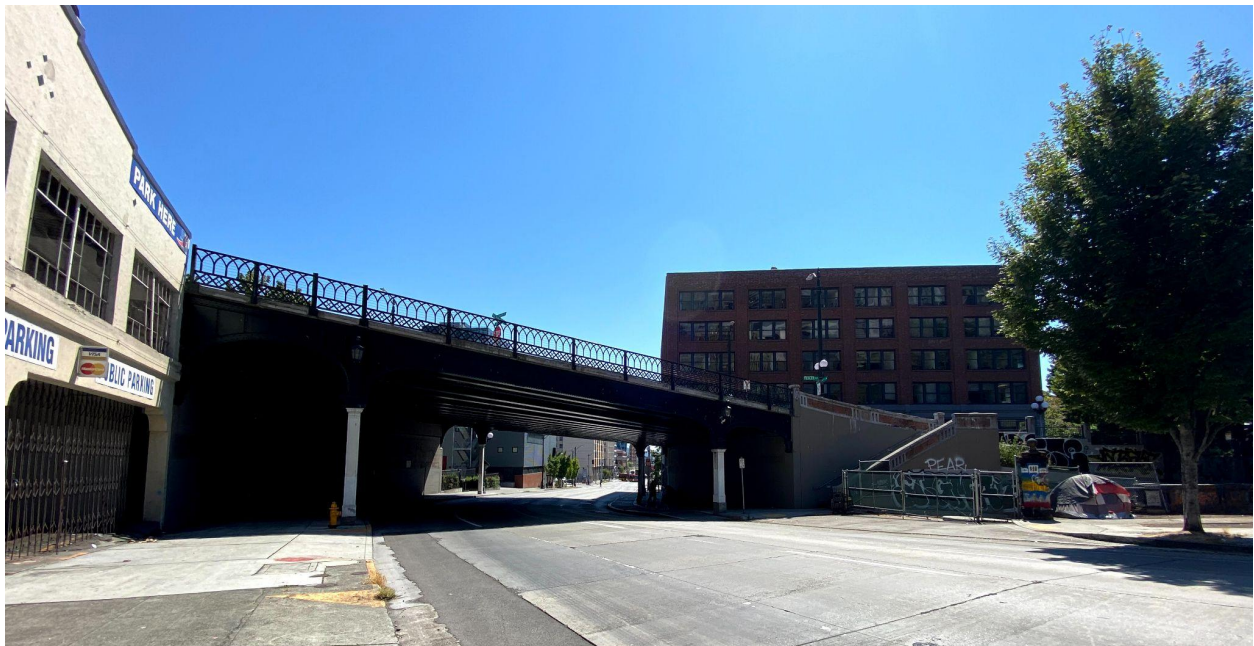
Photo of the project site looking south on 4th Ave (captured Wednesday, August 4, 2021):