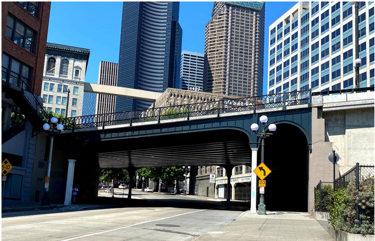
Photo of the project site looking north on 4th Ave (captured Wednesday, August 4, 2021):